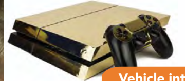
Vehicle interiors & consoles