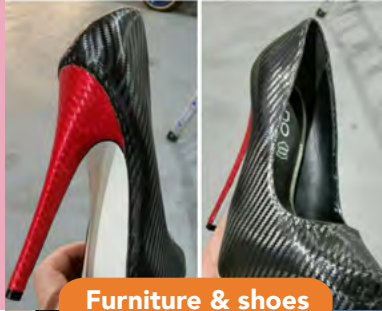
Furniture & shoes