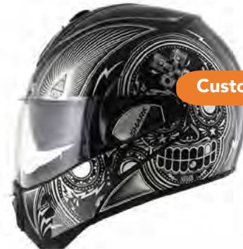
Custom wrap accessories