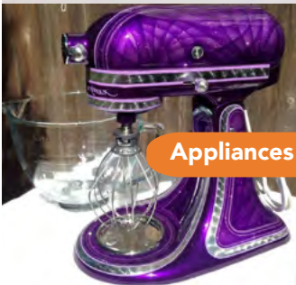
Appliances and phone covers